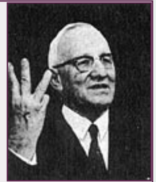
JESUS IS LORD

Long ago God spoke to our ancestors in many and various ways by the prophets, but in these last days he has spoken to us by a Son, whom he appointed heir of all things.