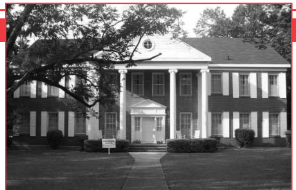
New Home of the Central Office • Ruston, Louisiana

Telephone: (318) 232-0004 • Fax: (318) 232-0300 Email: uca@christianashram.org