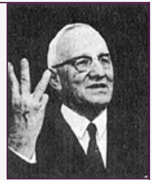
JESUS IS LORD